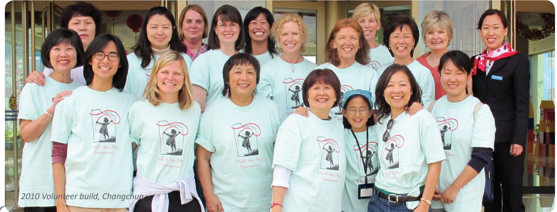
2010 Volunteer build, Changchun