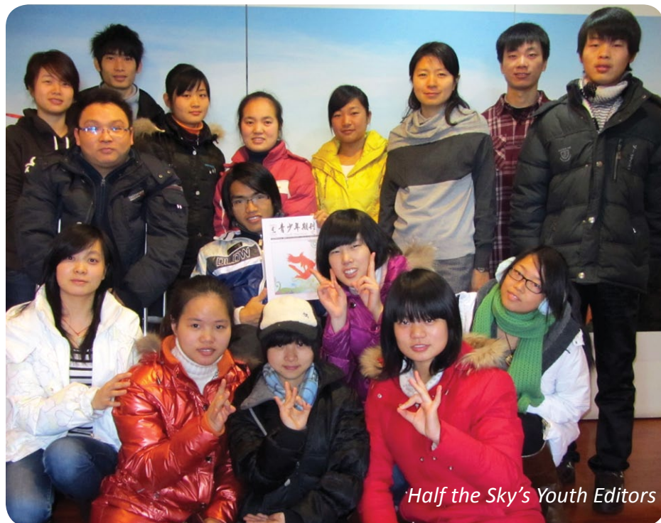
Half the Sky's Youth Editors

It was our young editors' first opportunity to visit Beijing, their first opportunity to taste Peking Duck, and their first opportunity to learn writing, editing, photography and layout skills from professionals.