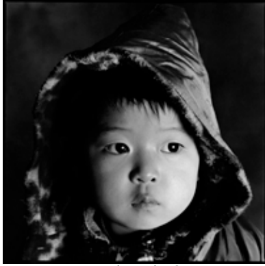
mei mei 50 Limited Edition Print 20" x 20" $250.00 unframed $450.00 framed