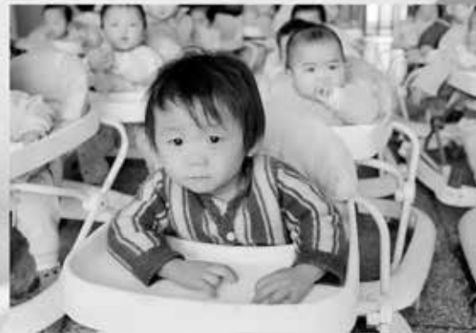
Rollerbaby.