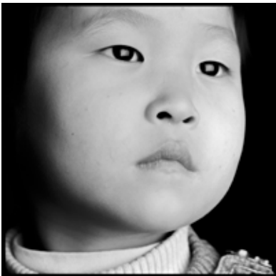
mei mei 16 Limited Edition Print 20" x 20" $250.00 unframed $450.00 framed