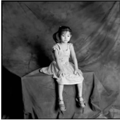
mei mei 63 Limited Edition Print 20" x 20" $250.00 unframed $450.00 framed