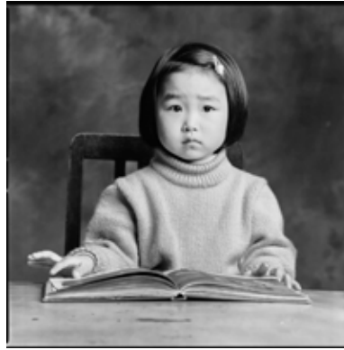
mei mei 15 Limited Edition Print 20" x 20" $250.00 unframed $450.00 framed