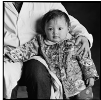
mei mei 117 Limited Edition Print 20" x 20" $250.00 unframed $450.00 framed