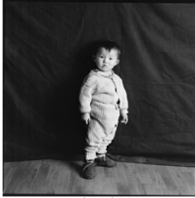
mei mei 111 Limited Edition Print 20" x 20" $250.00 unframed $450.00 framed