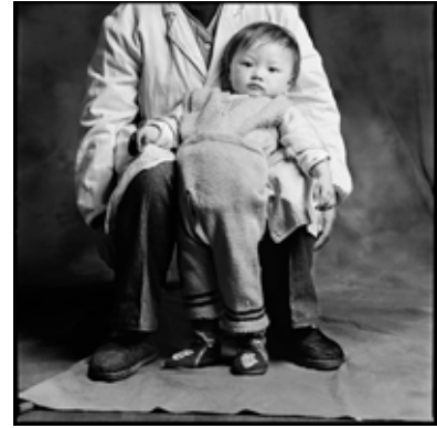
mei mei 23 Limited Edition Print 20" x 20" $250.00 unframed $450.00 framed