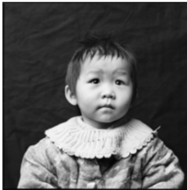
mei mei 31 Limited Edition Print 20" x 20" $250.00 unframed $450.00 framed