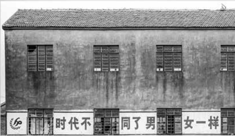
Village Billboard "These are new times. Girls are as good as boys"

There is an ancient Chinese legend that describes an invisible red thread joining those who are destined to connect, regardless of time, place, or circumstance. For photographer Richard Bowen, that thread