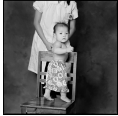
mei mei 22 Limited Edition Print 20" x 20" $250.00 unframed $450.00 framed